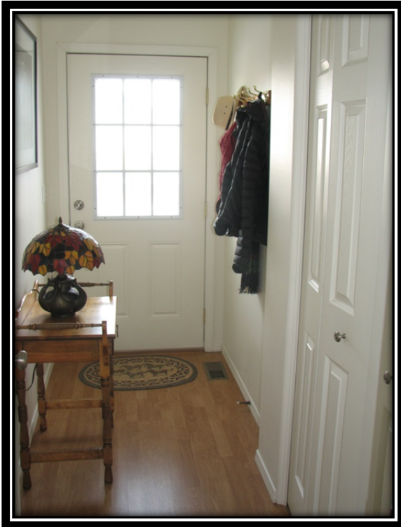
Laundry - Door to Back Yard Deck