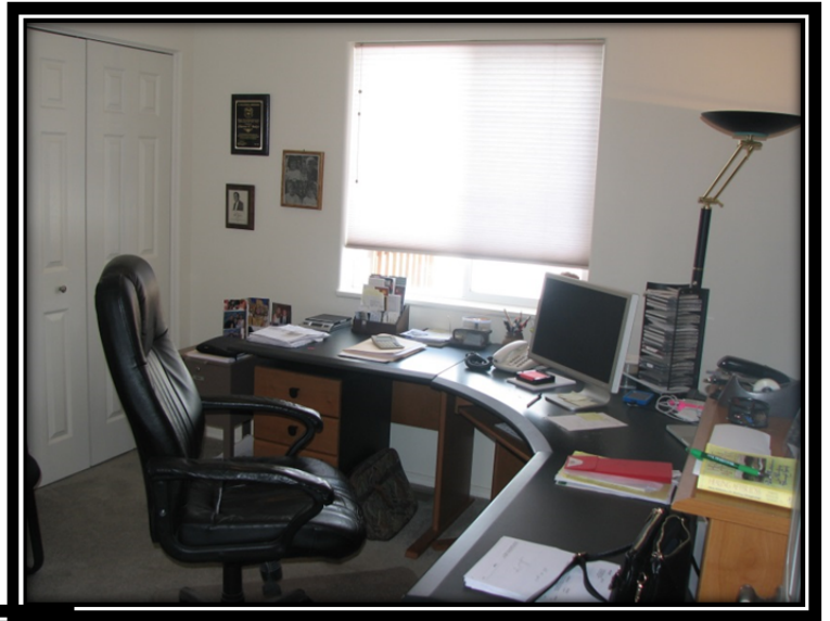
Office - 3 rd Bedroom