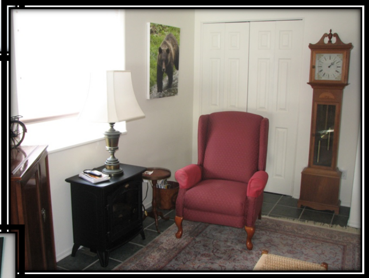
Or 4 th Bedroom