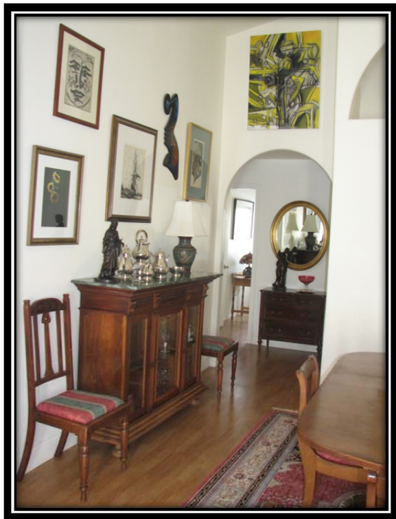
Dining Looking into Living Room